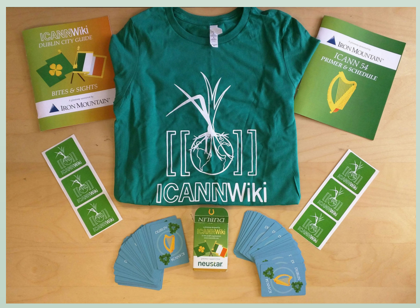
A collection of ICANNWiki collateral and giveaways from ICANN54 in Dublin.